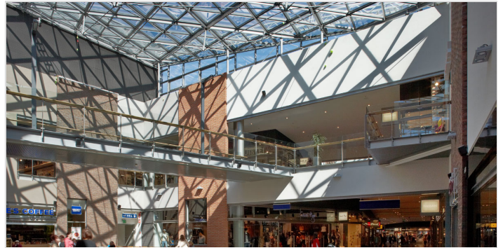
Interior steel structures